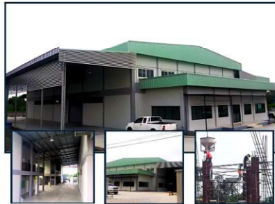
Warehouse with office